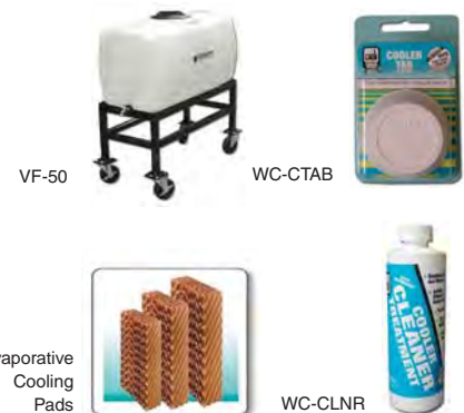
Evaporative Cooling Pads

For more information on these products, please visit our website at: www.schaeferfan.com