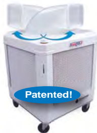
WC-1HPMFOSC Spout oscillates 120°

Spot cool your deck, patio or work area with high performance, environmentally friendly WayCool® evaporative coolers.